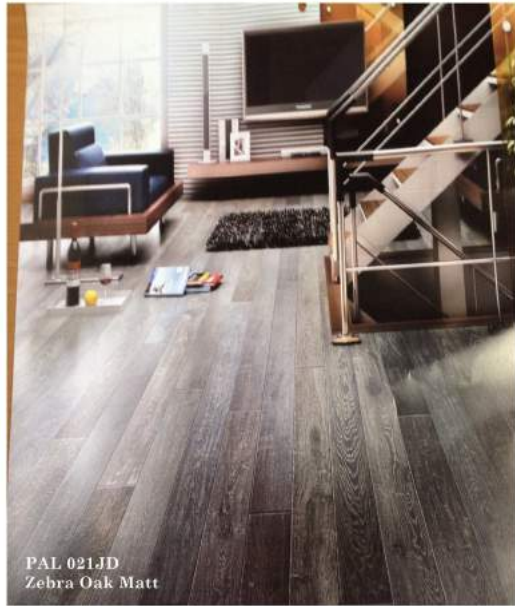
PAL 021JD Zebra Oak Matt