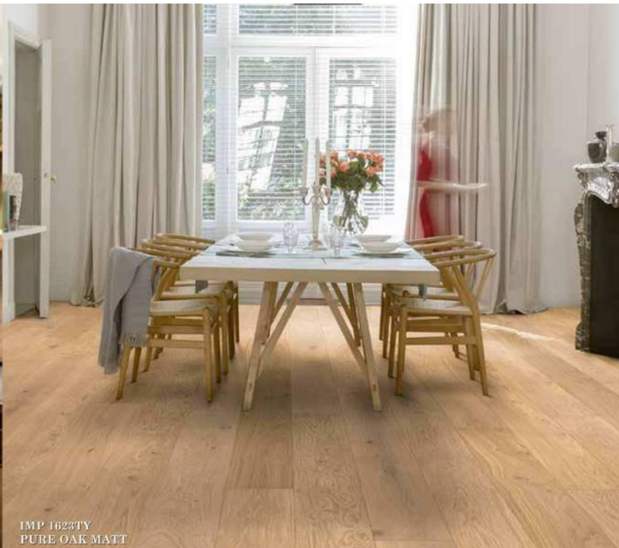
IMP 1623TY PURE OAK MATT