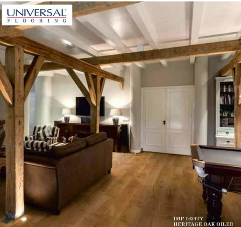
IMP 1624TY HERITAGE OAK OILED