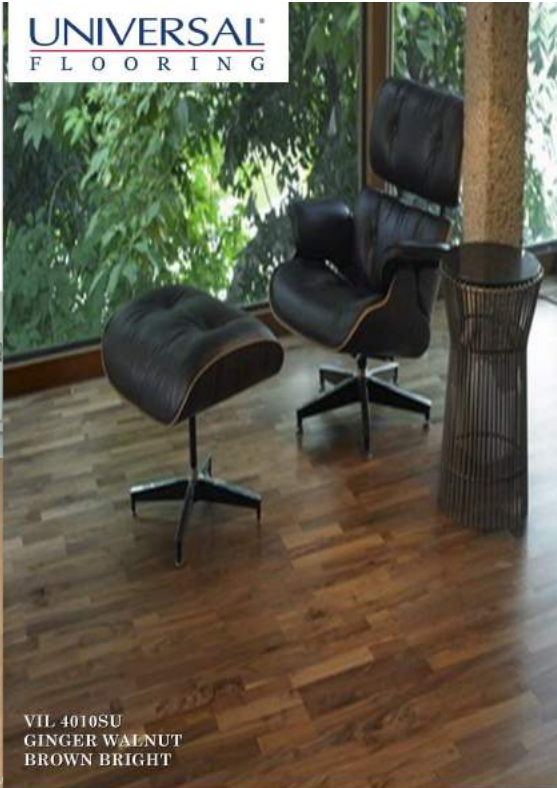
VIL 4010SU GINGER WALNUT BROWN BRIGHT