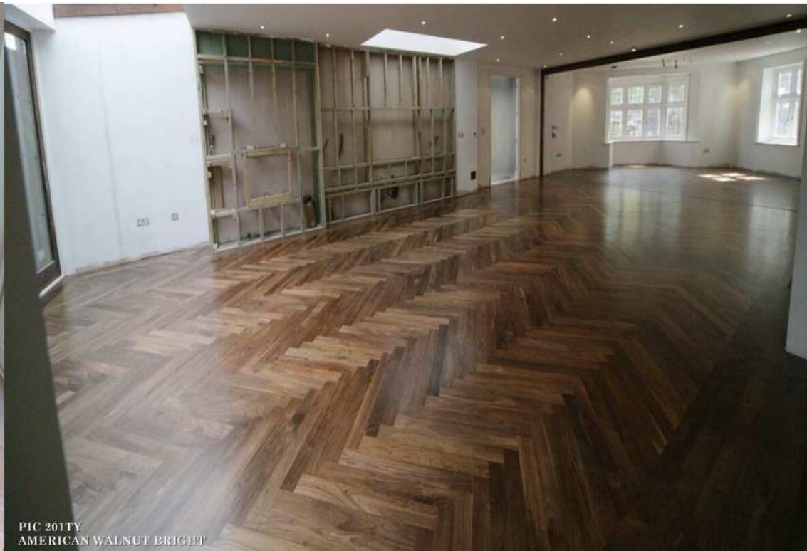
PIC 201TY AMERICAN WALNUT BRIGHT