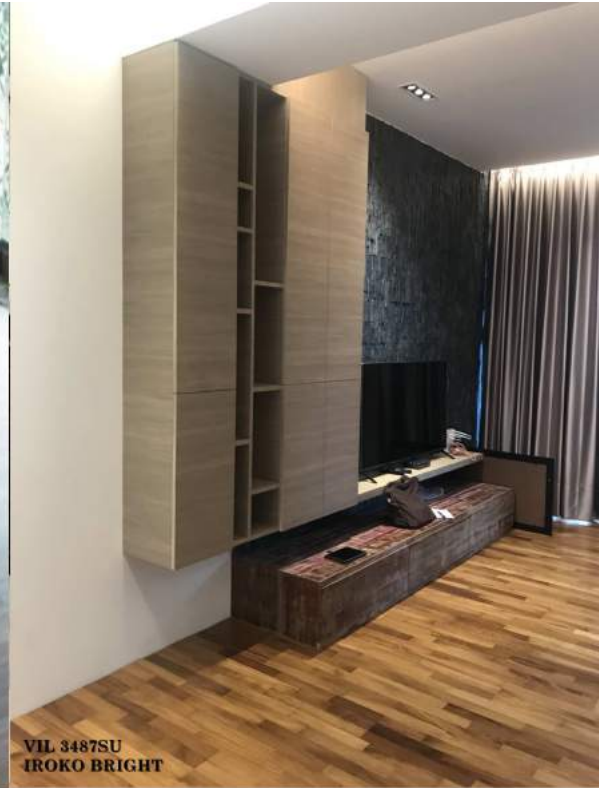
VIL 3487SU IROKO BRIGHT