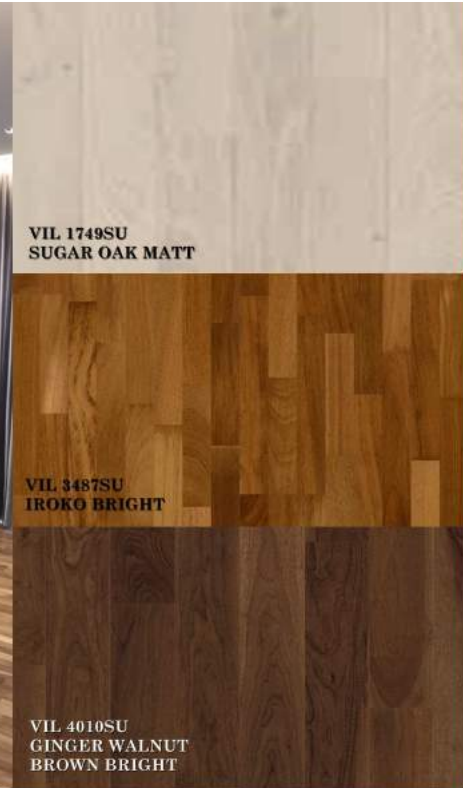
VIL 1749SU SUGAR OAK MATT