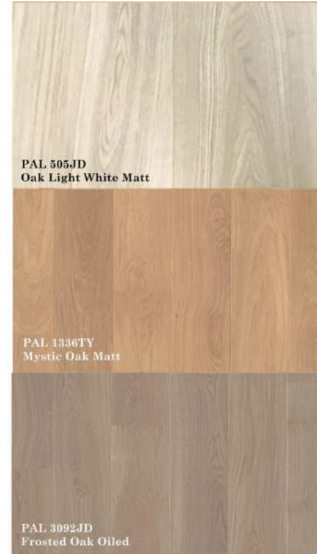
PAL 505JD Oak Light White Matt