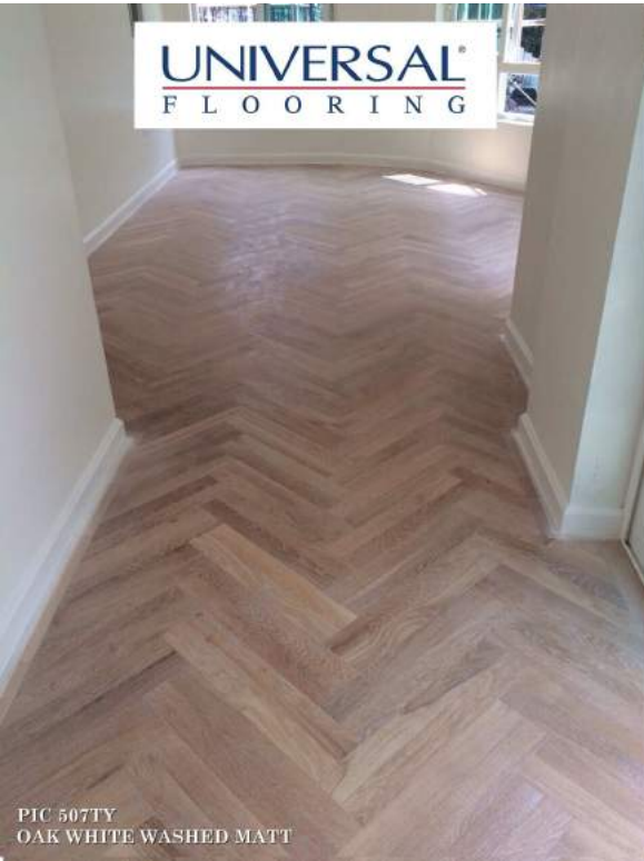
PIC 507TY OAK WHITE WASHED MATT