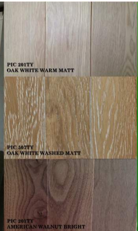
PIC 201TY OAK WHITE WARM MATT