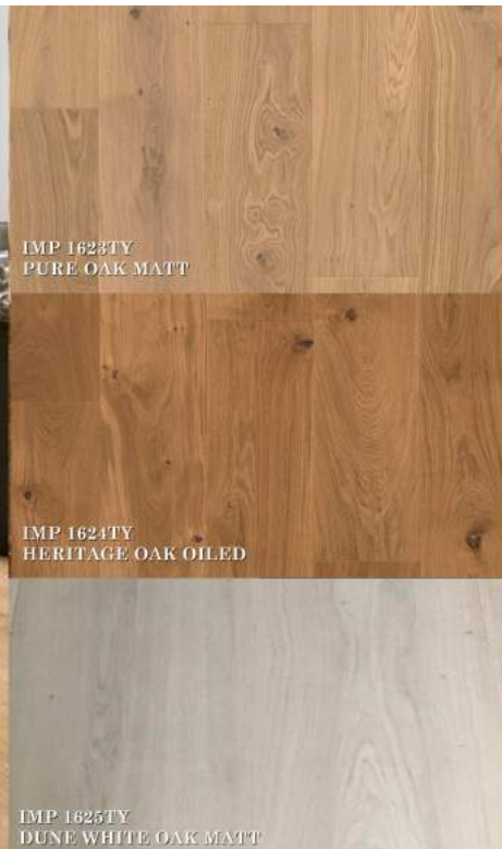
IMP 1623TY PURE OAK MATT