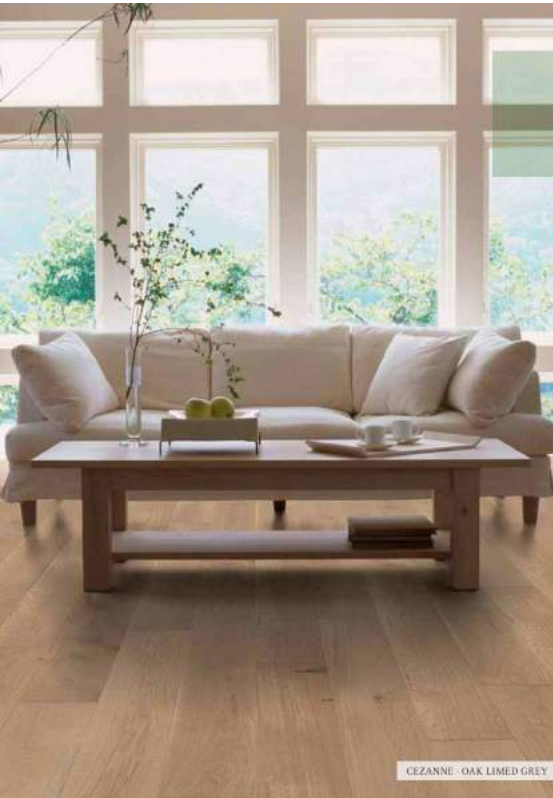
CEZANNE - OAK LIMED GREY