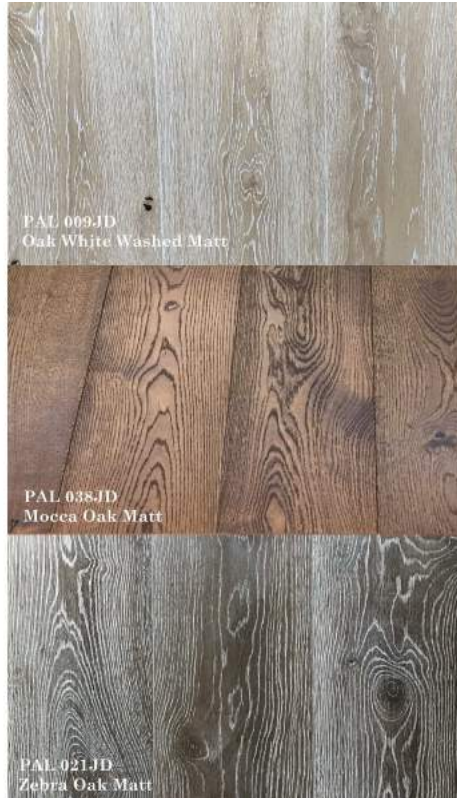
PAL 009JD Oak White Washed Matt