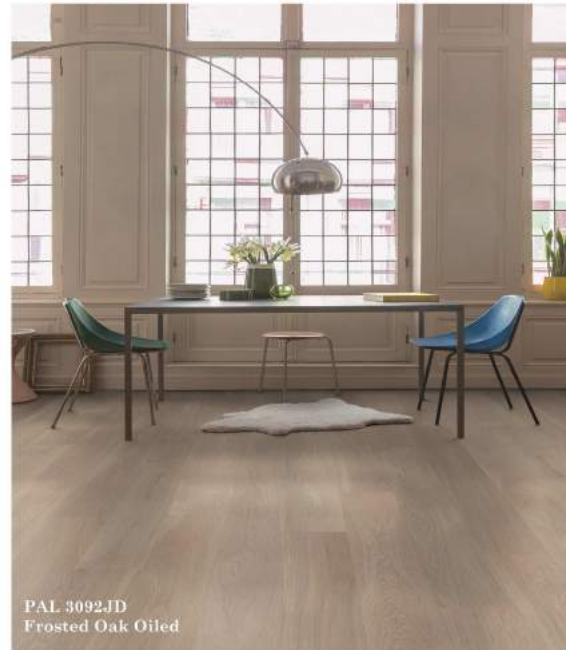
PAL 3092JD Frosted Oak Oiled